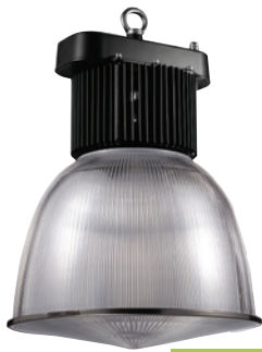
/// HighBay GRHB