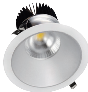
/// Commercial GRCLM