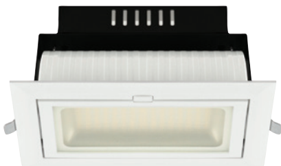
/// Shoplight SL38