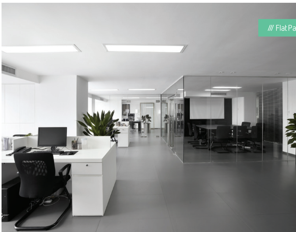
/// Flat Panel GRP48

/// DISCOVER THE LED COMMERCIAL AND INDUSTRIAL RANGE BY GREEN ILLUMINATION. DESIGNED AND ENGINEERED FOR PERFORMANCE AND RELIABILITY.