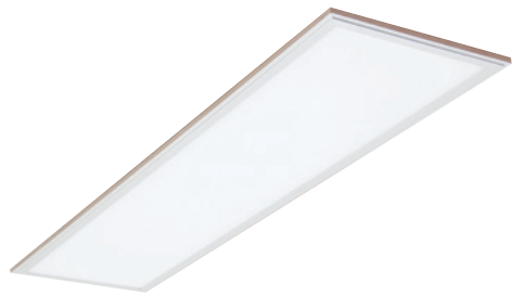
/// Flat Panel GRP48